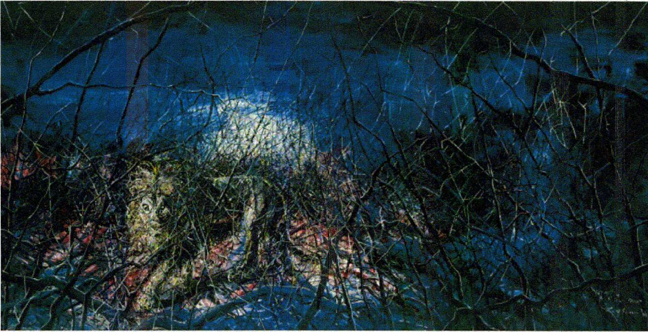
Zeng Fanzhi - Lion, 2008 - Oil on canvas, 280 x 540 cm.

New York , NY - Acquavella Galleries will present the first U.S. solo exhibition of Chinese contemporary artist Zeng Fanzhi from April 2 through May 15, 2009. Most of the approximately 20 oil on canvas works in the exhibition, featuring Fanzhi's newest landscapes and recent portraits, will be shown publicly for the first time. Fanzhi is one of the most in-demand of his peer group, and set a new world auction record for Chinese contemporary art in May 2008, when his diptych Mask Series 1996 No. 6 sold for $9.7 million at Christie's in Hong Kong.